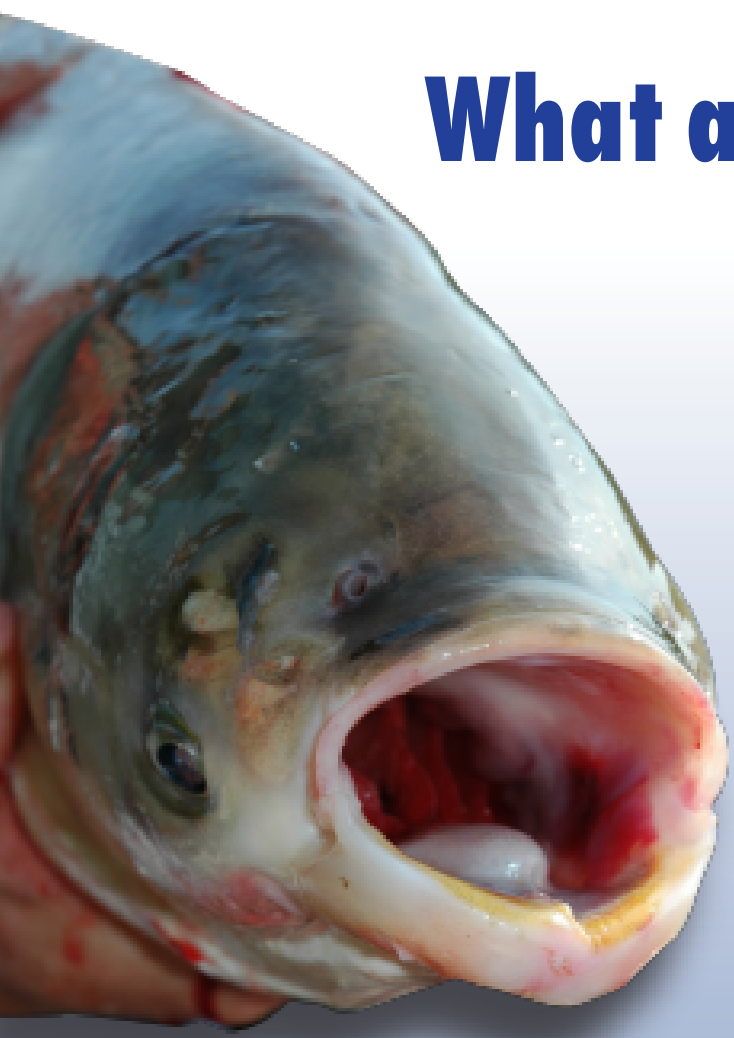
Silver carp.