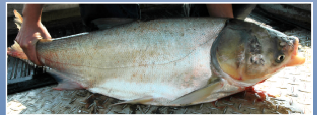
Silver carp.

If Asian carp enter the Great Lakes, there is a high likelihood they will become established and spread.