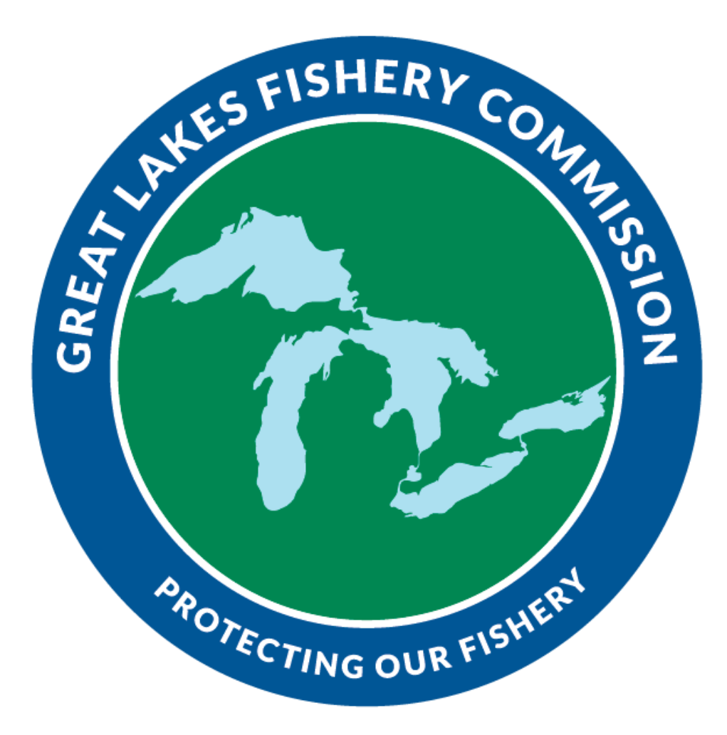
Fishery Management Document 2020-01